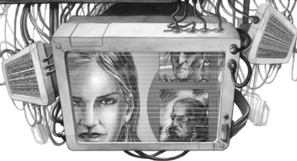
TABLE OF CONTENTS PROTEUS UNRAVELED